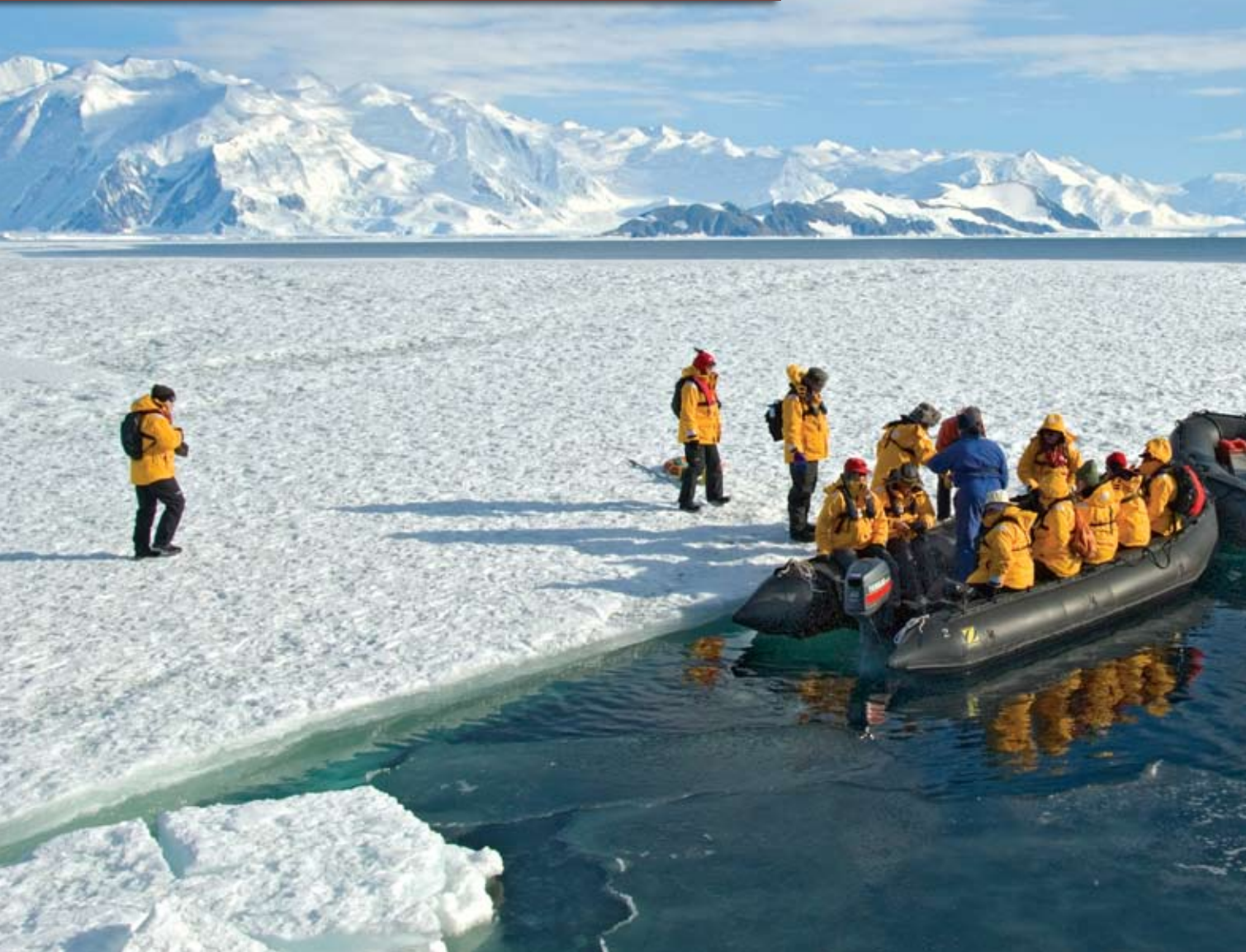
Zodiac landing on sea ice