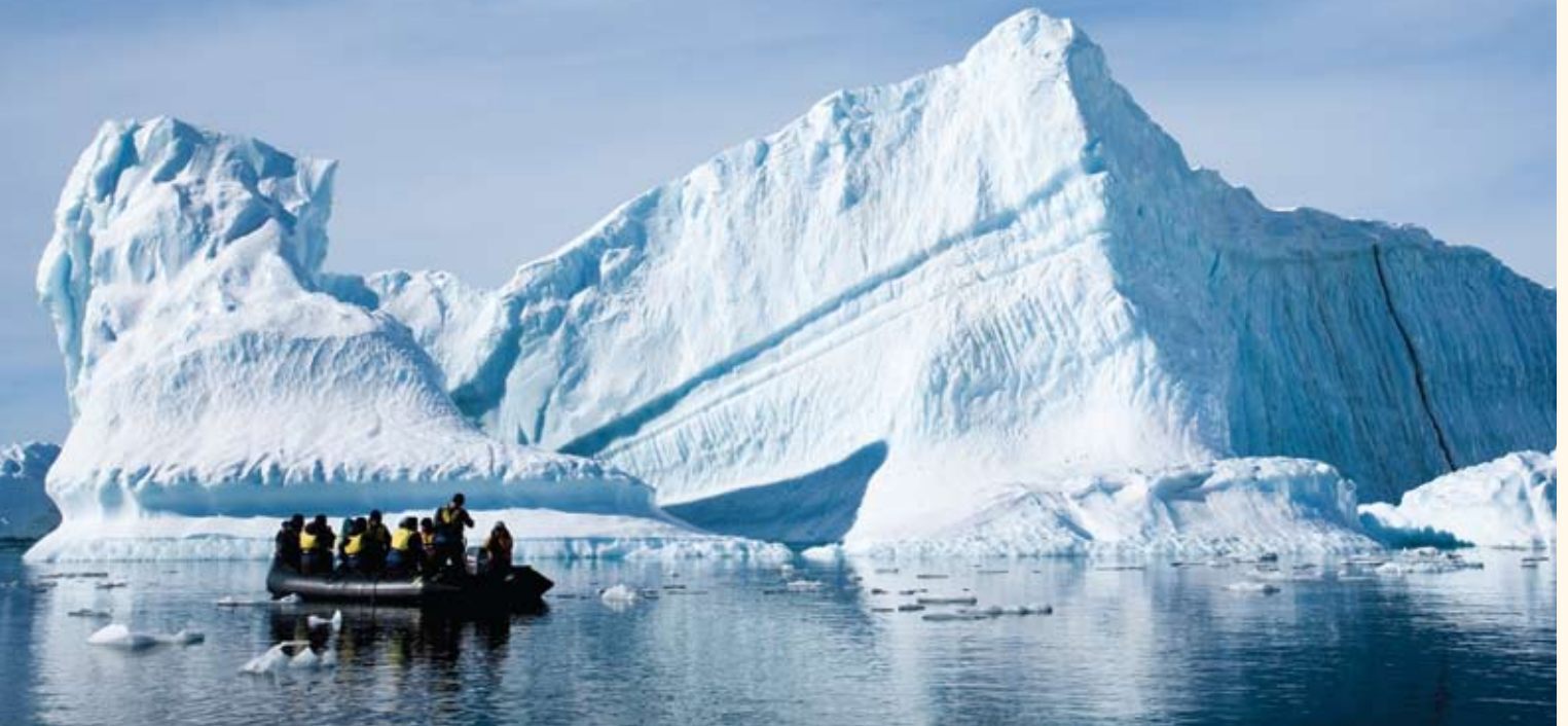
Sensational Icebergs