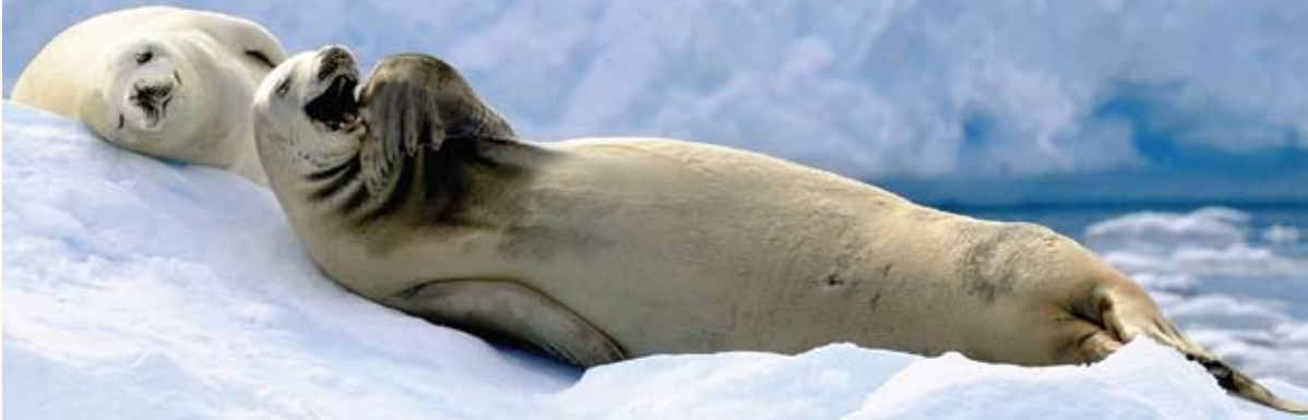
Lounging Crabeater Seal