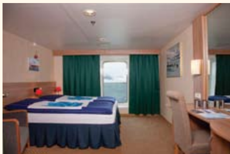
Category 4 Twin Cabin M/S Expedition