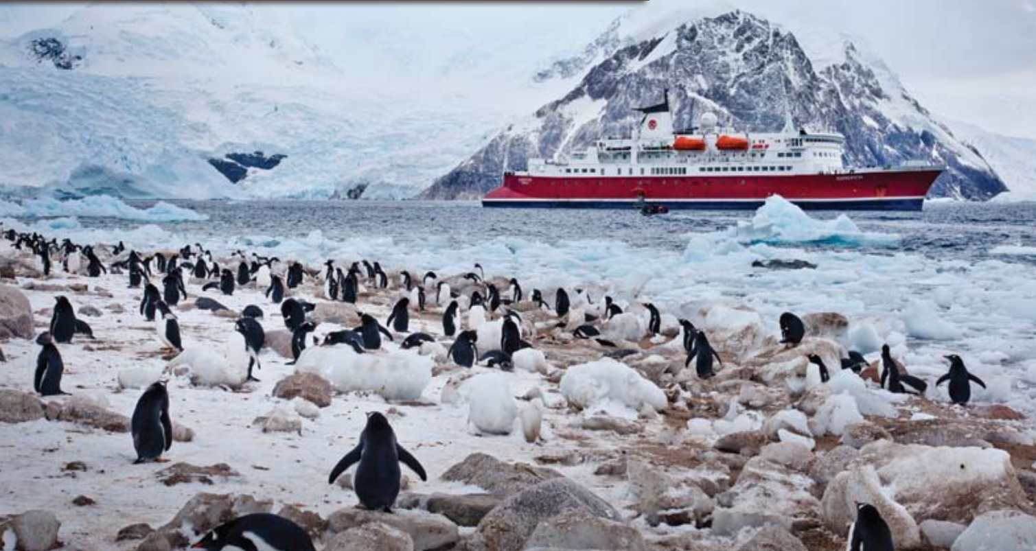
Adelie penguins