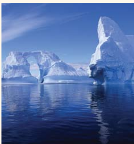
Stunning Antarctic Icebergs

Price excludes: Airfares, pre and post land arrangements, passport and visa expenses, government arrival and departure taxes, meals ashore, polar clothing, baggage, cancellation and personal insurance, excess baggage charges and all items of a personal nature such as laundry, bar, beverage charges and telecommunication charges, emergency evacuation charges and gratuities. Fuel surcharges may apply in the event of an increase in world fuel prices.