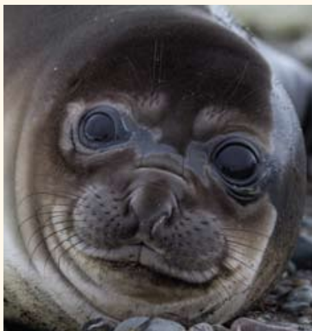
Elephant Seal Pup

#This departure incorporate one night at a hotel in Ushuaia (B&B), transfer airport to hotel on arrival, hotel-ship on embarkation and ship-airport on disembarkation.