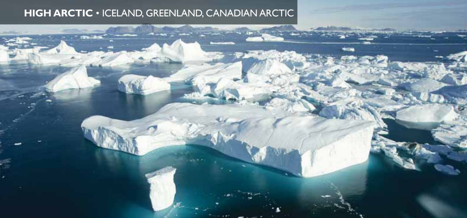
The Iceberg Fjord, Greenland