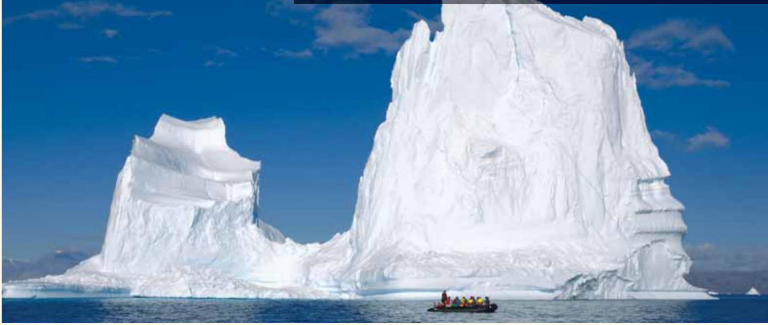
Scoresby Sound in Greenland, the world's largest fjord