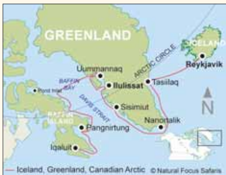
Iceland, Greenland, Canadian Arctic