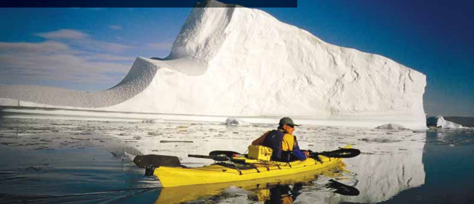
Kayak excursion amongst icebergs