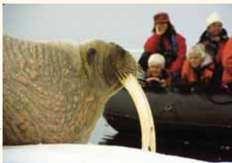
Close-up wildlife viewing