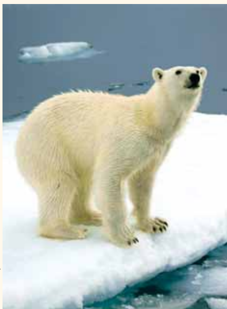
Polar bear on sea ice off Spitsbergen

Price excludes: Laundry, postage, personal clothing, medical expenses, personal travel insurance and items of a personal nature such as bar charges and phone calls, emergency evacuation charges.