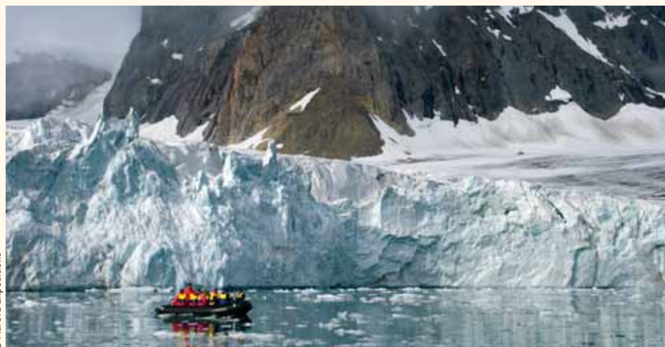
A zodiac dwarfed by Monaco Glacier