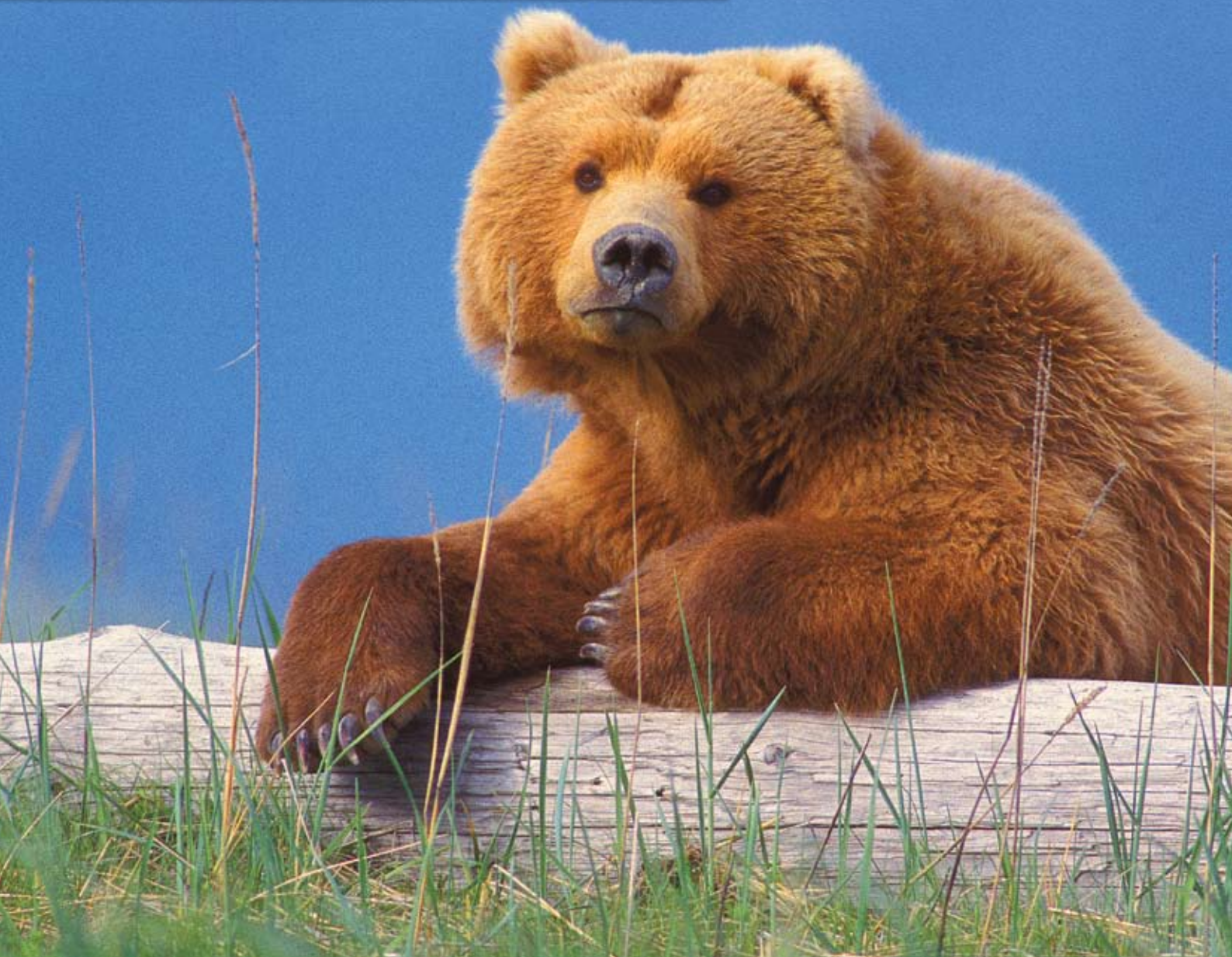
Spectacular Katmai bear viewing