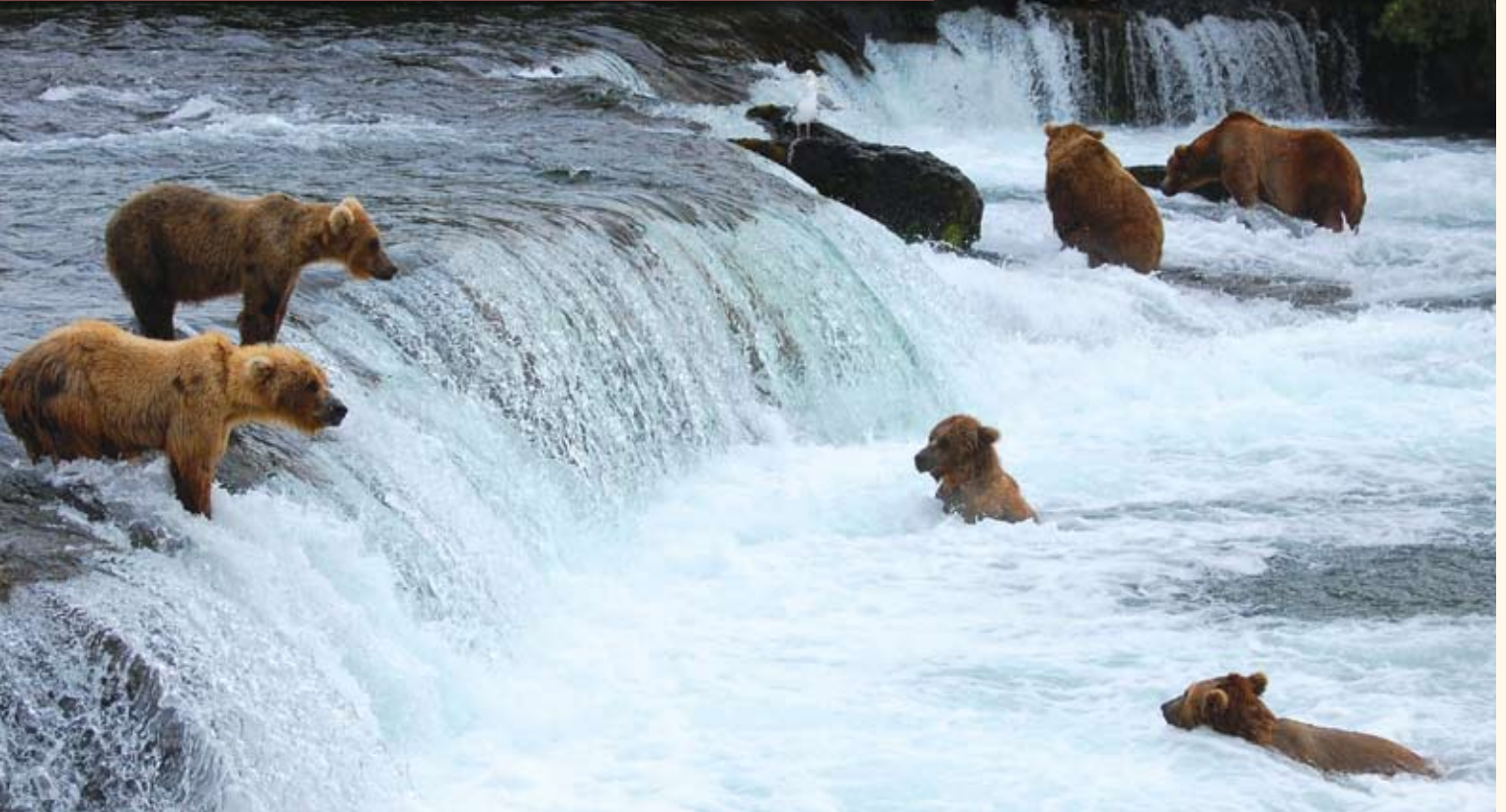
Brooks Falls, lots of action!