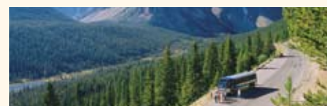
Coach & Minivan Tours p25, 26, 29, 36, 37, 50