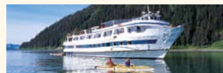
Small Ship Cruises p8-15, 46, 47