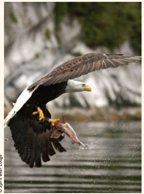
Remote wilderness lodges