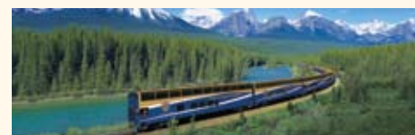
Rail Journeys p24-28