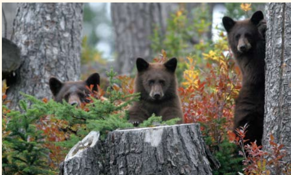
Daisy and her two cubs, Whistler Mountain