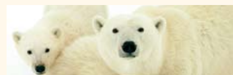
Polar Bears p42, 43