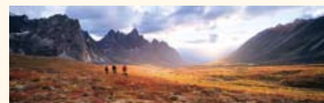
Adventure p29, 36