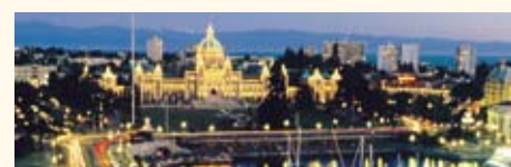
City Stays p21, 22, 23, 38, 39, 48, 49