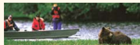
Wilderness & Wildlife Areas p16-20, 29-36