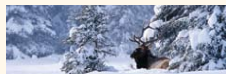
Winter Tours p40, 41