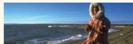
Arctic Circle p44-47