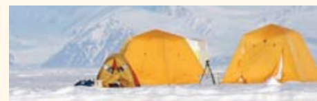
Camping p29, 44, 45