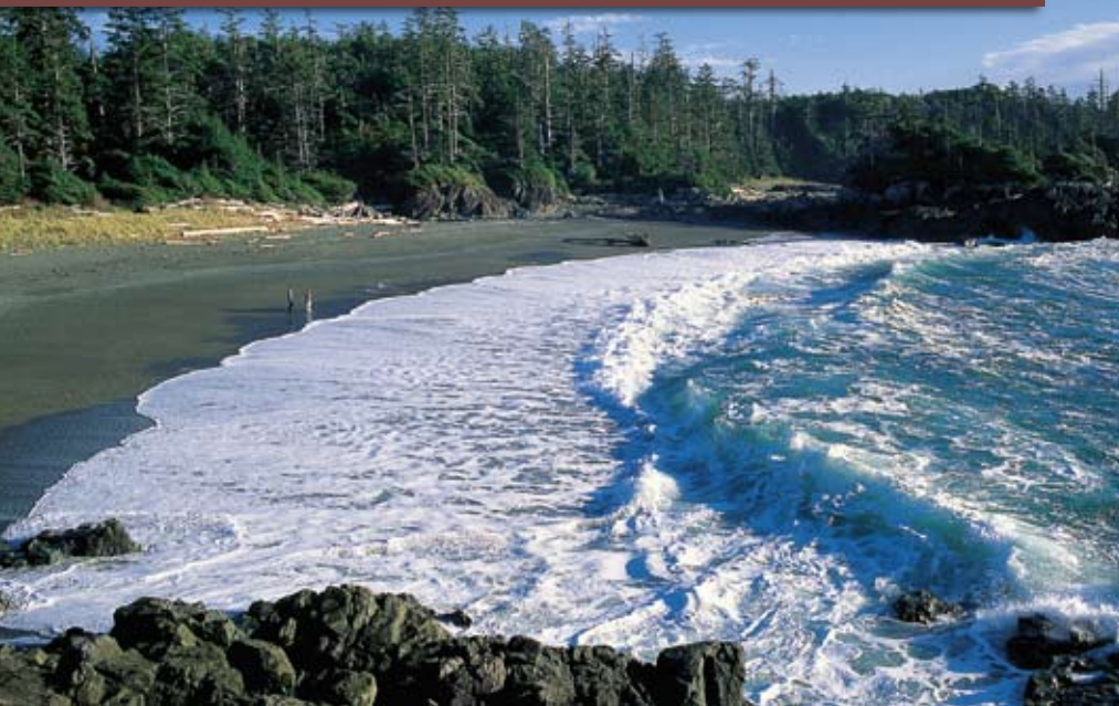
South Beach in the Pacific Rim National Park, Tofino