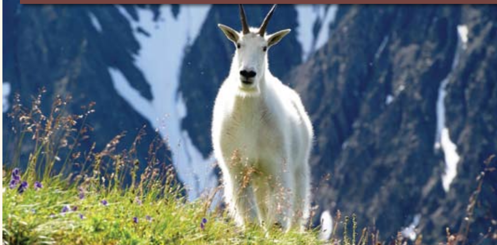
Mountain Goat © Midnight Sun