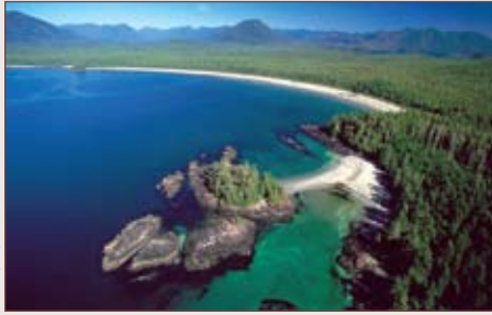
Beautiful Clayoquot Sound