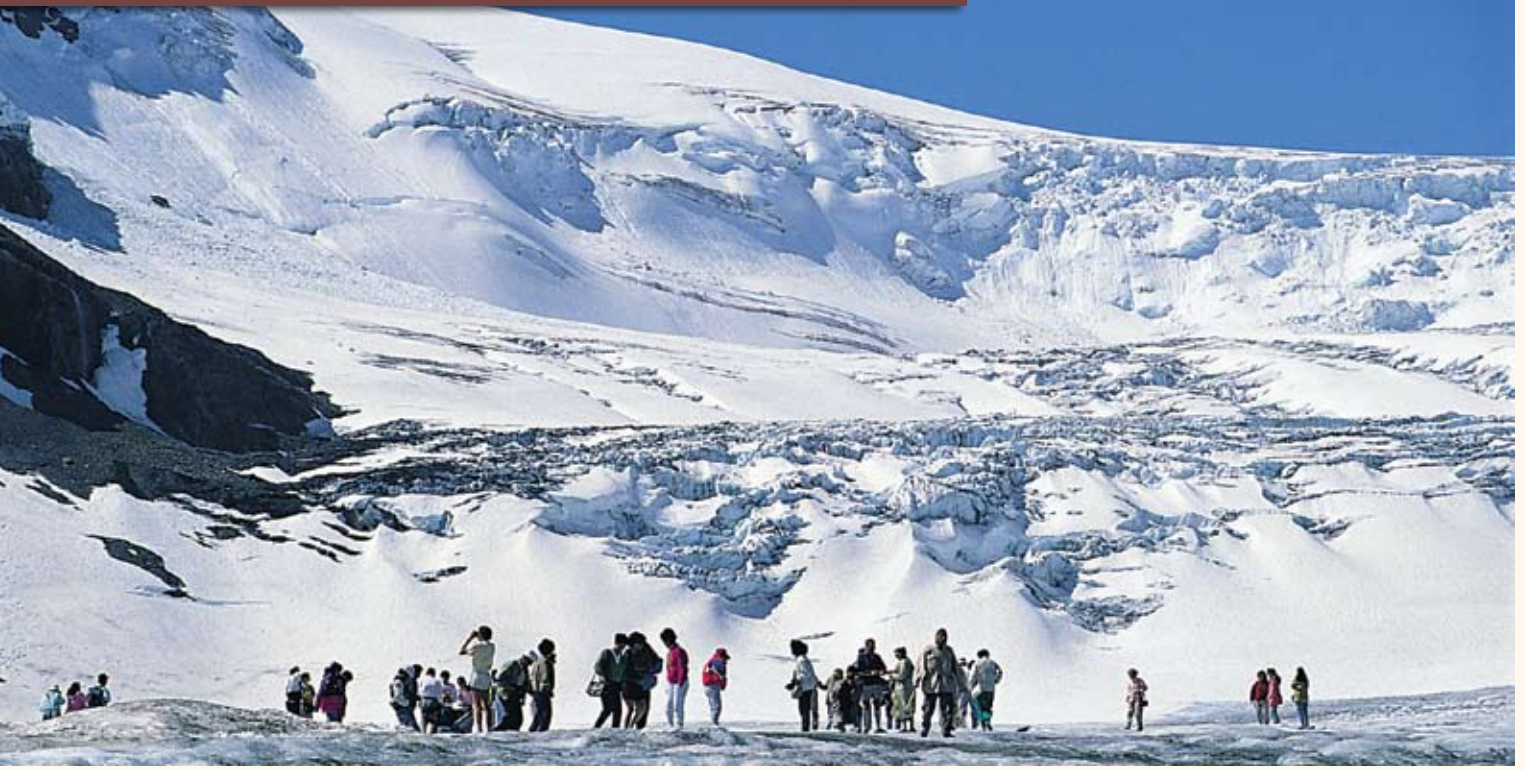
Columbia Icefields © Brewster Inc.