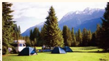
Camping in the Rockies