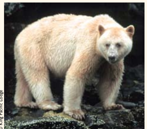
The rare Spirit (Kermode) Bear

Fly back to Vancouver where your tour ends.