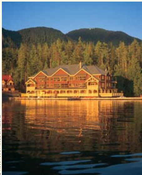
Sunset at King Pacific Lodge