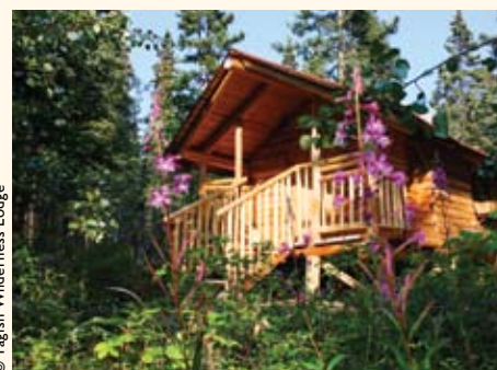
Tagish Wilderness Lodge

Winter tours are also available 19 Feb-06 Apr 12. Please enquire for more information.