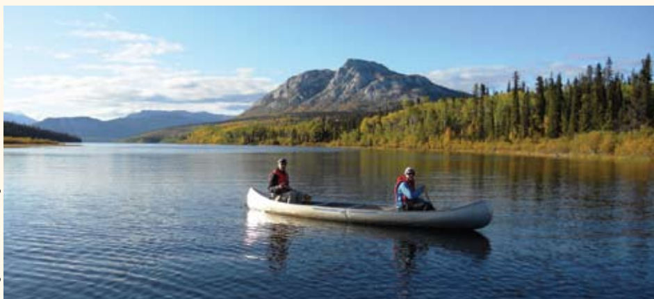
Canoeing on stunning Tagish Lake