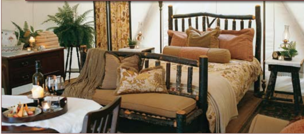
Deluxe Outpost Tent

A ccessible only by boat or floatplane, E co-conscious Clayoquot Wilderness Outpost is a secluded enclave with 12 luxury ensuite tents and 8 safari-style tents with private showers and composting toilets. There is also a ranch-style cookhouse providing world class cuisine, lounge, spa, wood fired hot tubs and woodstoves. While at Clayoquot enjoy both guided and unguided activities including paddling, biking and hiking. This region is home to prolific wildlife including bears, puffins and porpoises. You are also invited to take part in environmental programs funded by the resort.