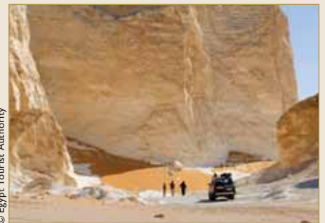
White Desert, north of Farafra

Visit the local art museum and some natural hot springs before driving back to Cairo where the tour ends. BL