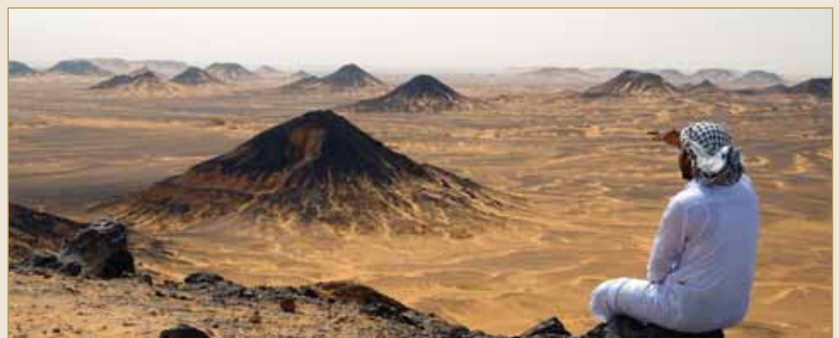
Black Mountains near Baharia