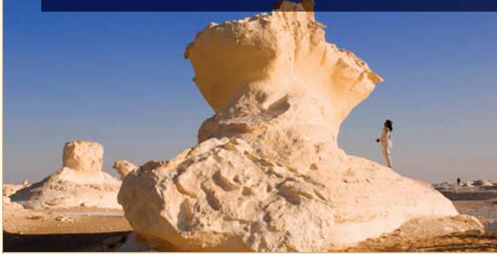
Incredible sculpted rocks of the White Desert