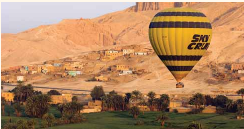
Balloon flying over the Theban Necropolis

Stay one day longer in Luxor and take a full day tour to the well preserved temple of Hathor at Denderah and the great temple built by Seti I at Abydos further down the Nile. Please call us or your travel agent for details.