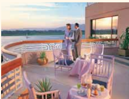
Sonesta St George terrace

On Luxor's East Bank and overlooking the Nile this comfortable five star hotel features 230 guest rooms and suites, a range of restaurants and bars, outdoor heated pool, fitness centre and shops.