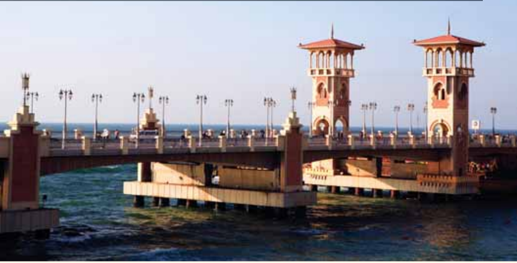
The Stanley Bridge, Alexandria