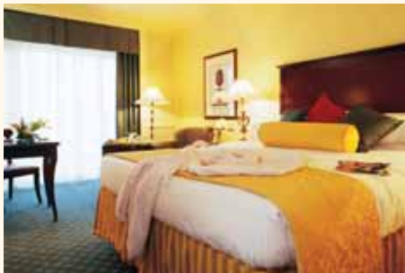
Cairo Marriott Hotel