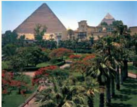
Mena House Oberoi - Gardens with a view!

At the foot of the Great Pyramids of Giza, this palatial hotel's royal history is reflected in the exquisite antiques and rich textiles of the interior. The hotel offers 523 rooms and suites, gourmet restaurants, golf, tennis, pool and gym.