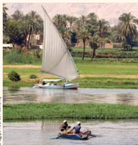
Nile Valley between Luxor and Esna

Depart early on a half day tour of the temple complexes of Luxor and Karnak. Afternoon at leisure. Optional tour to Luxor Museum. B