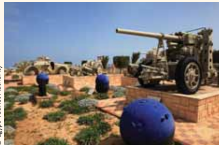
El Alamein War Museum