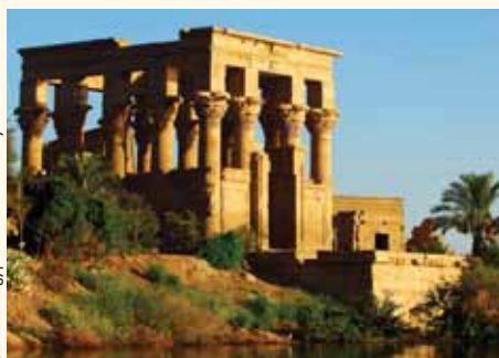
Philae Temple, Aswan

Transfer to Aswan airport where your tour ends. B