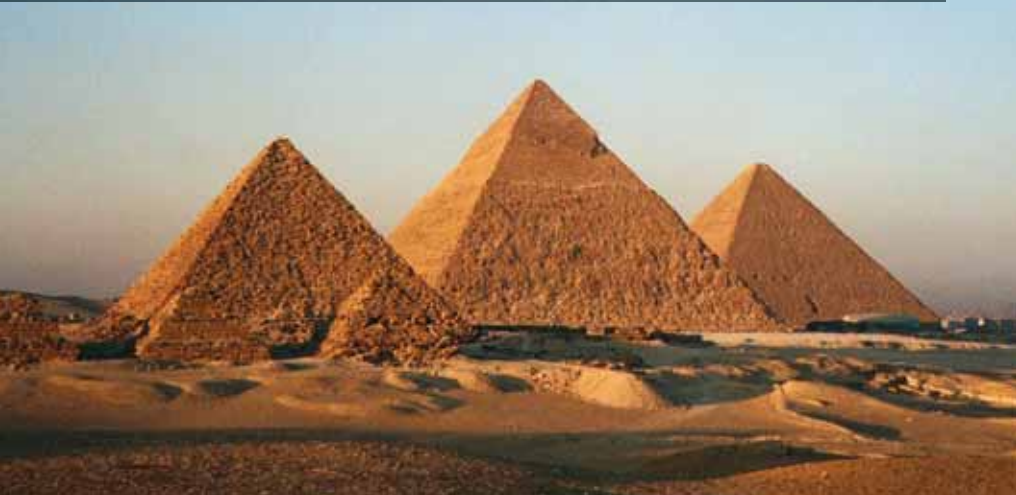
The great Giza Pyramids