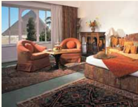
Mena House Oberoi Superior Room