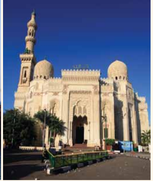
Abu Al Abbas Mosque, Alexandria