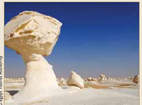
The White Desert