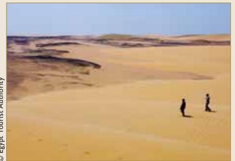
Stunning desert landscape approaching the Black Desert