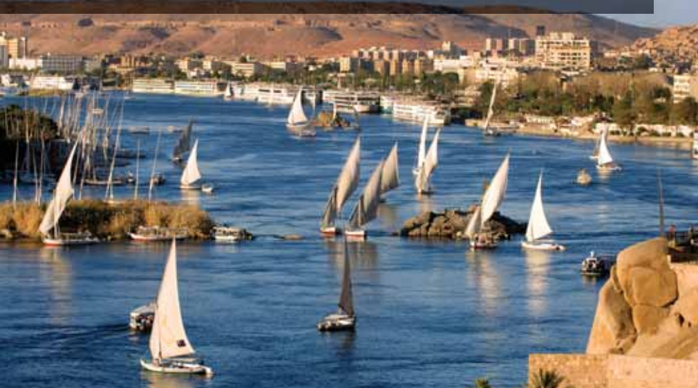
Feluccas on the Nile, Aswan