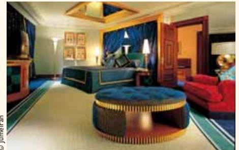
Burj Al Arab one bedroom deluxe suite

The luxurious Burj Al Arab is located in the Jumeirah Beach area of Dubai on a man-made island 280m offshore. Dominating the Dubai coastline, the hotel has 202 beautifully decorated air-conditioned suites with sumptuous living and dining areas and a state of the art entertainment system with 57 cable channels and video on demand. Hotel facilities include eight restaurants, shopping, unlimited access to Wild Wadi Water Park, The Assawan Spa & Health Club, swimming pools, squash court and fitness studios.