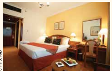
Marco Polo Hotel

Surrounded by 38 acres of gardens and only minutes from the city's shopping districts, Le Meridien combines contemporary luxury with Dubai's European flair. The hotel features 383 elegantly furnished rooms with all modern amenities including internet access, 18 restaurants, 3 swimming pools, fitness studio and tennis courts.