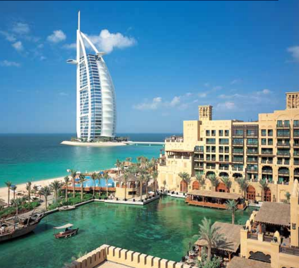
The magnificent Burj Al Arab with Madinat Jumeirah Resort in the foreground