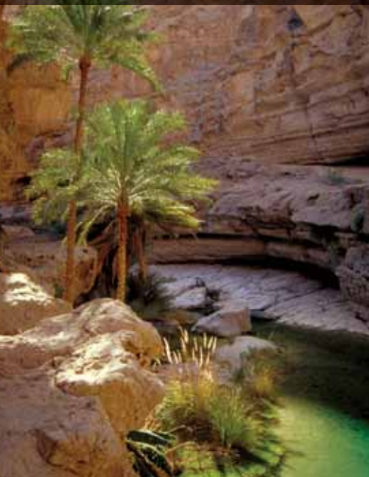
Beautiful oasis at Wadi Bani Khalid