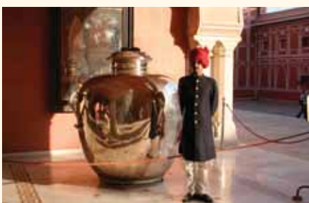
Standing Guard, Amber Fort, Jaipur

Early morning visit to the magnificent Taj Mahal (closed Fri). Visit 16th century Agra Fort built by the great Emperor Akbar, a masterpiece of design. Drive back to Delhi (5 hrs) stopping en route to visit Akbar's tomb at Sikandra. Tour ends. B