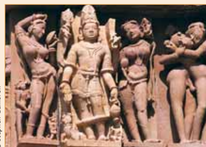
Khajuraho Temple Frieze