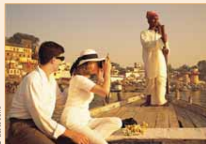
Varanasi boat ride