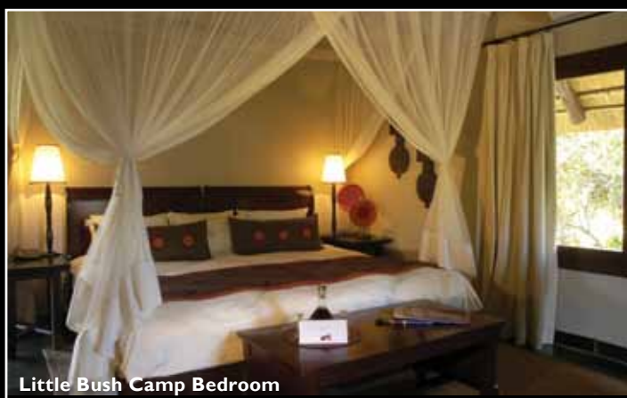
Little Bush Camp Bedroom