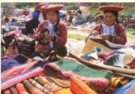
Street market, Cusco

South America has many fascinating archaeological and historical sites from ancient pre-Inca remains to impressive Inca ruins, particularly in Peru, Bolivia, Ecuador, northern Chile and Argentina. See extravagant Spanish or Portuguese colonial architecture, such as in Cusco or Arequipa in Peru, Quito in Ecuador, or Salta in Brazil. Much of the indigenous culture remains alive in the small towns with their festivals, markets and traditional arts and crafts.