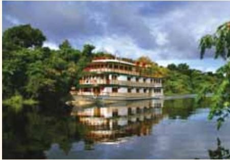
Amazon Clipper Premium Boat

Explore the Amazon River and its tributaries on a riverboat cruise from Iquitos in Peru or Manaus in Brazil. Boats offer comfortable or luxury accommodation, air-conditioning and good food. Naturalist guides will accompany you on shore excursions to see wildlife or visit Indian villages.