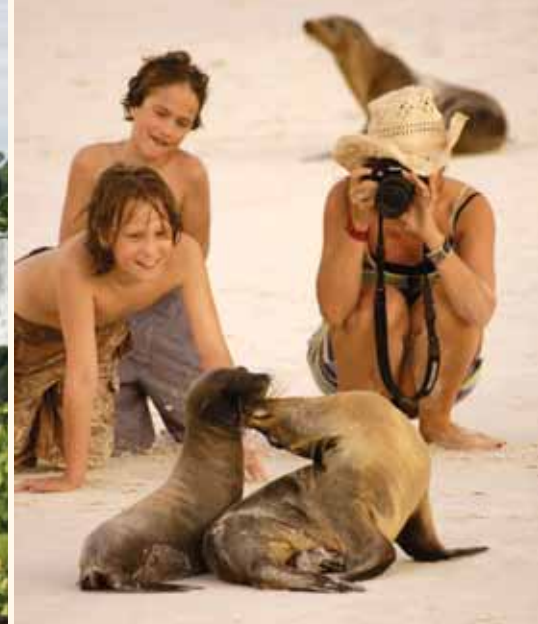
Relaxing with the locals