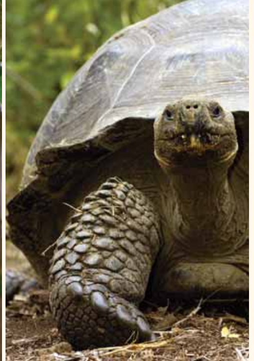
Galapagos Tortoise, the world's largest