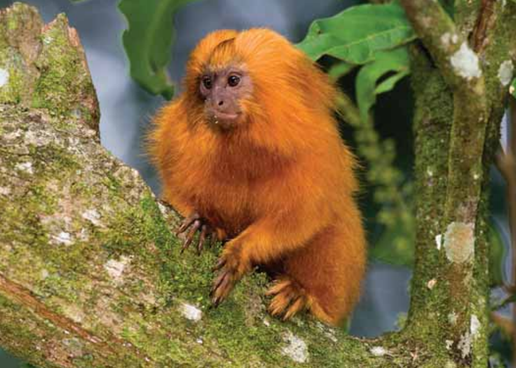
The endangered Golden Lion Tamarin