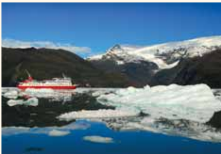
M/V Skorpios III

Patagonia is famous for its mountains, glaciers, lakes, fjords and marine wildlife. Explore this spectacular land on a small ship cruise through the waterways of Tierra del Fuego in southern Chile, on board the Stella, Via Australis or the M/V Skorpios. Or further north in the famous Lakes District embark on the "Crossing of the Lakes", travelling by boat and bus between Chile and Argentina.