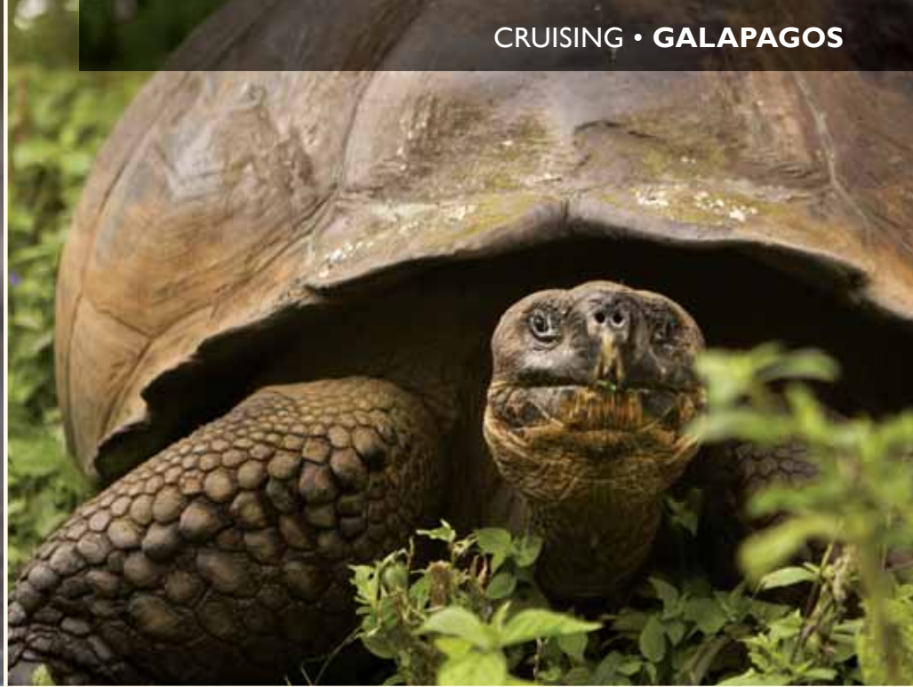
Giant Galapagos Tortoise