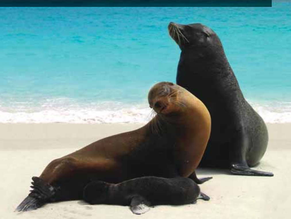
Family of Seals basking on the beach