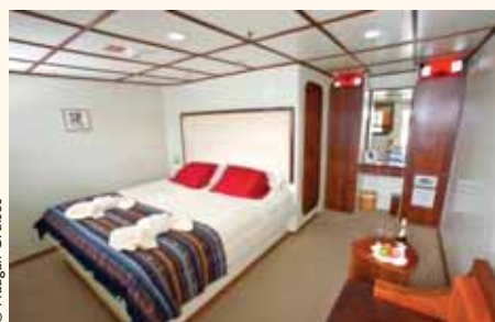
Athala II cabin