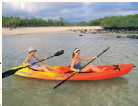
Finch Bay kayak excursion