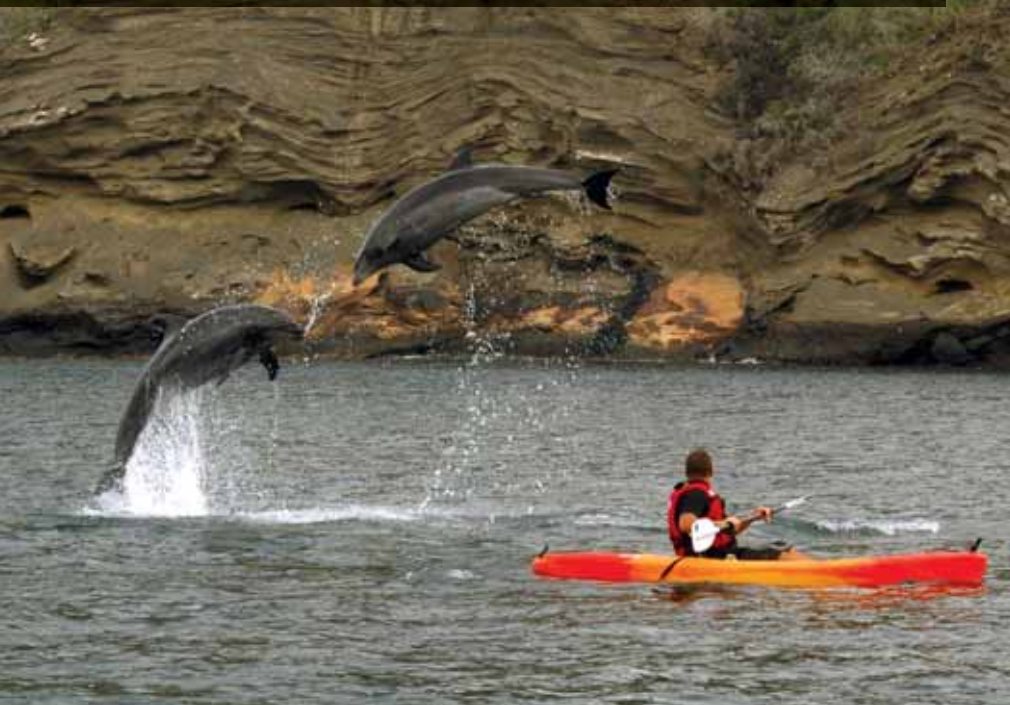
Exceptional Galapagos wildlife experience