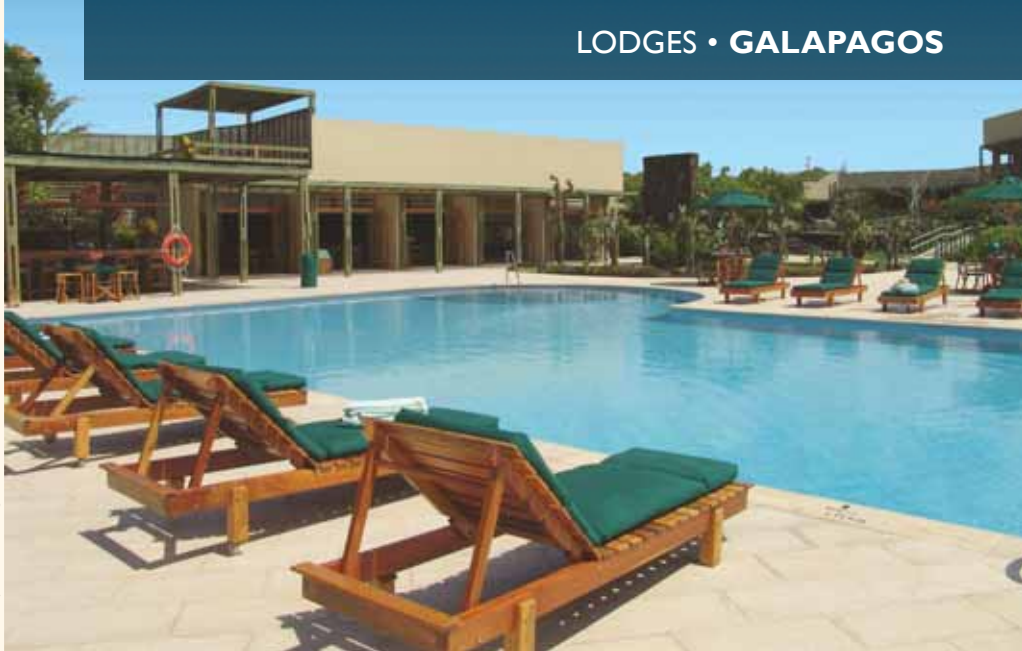
Finch Bay Hotel

Early morning visit the Charles Darwin Research Station before transferring to the airport. Tour ends. B