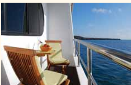
Nina private deck