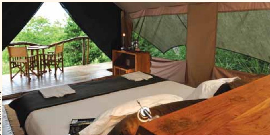
Galapagos Safari Camp tent

Transfer from Baltra airport to the camp for lunch. Enjoy an afternoon tour taking in pit craters, lava tunnels, forests and the Tortoise Reserve. LD