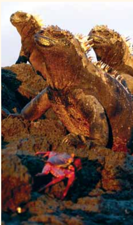
Marine Iguanas in the sunset