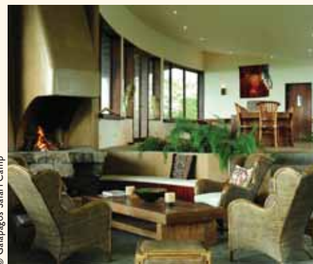
Galapagos Safari Camp main lodge

Wake for an early morning sunrise and farm tour before transferring to Baltra airport where your tour ends. B