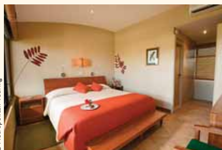
Finch Bay Hotel Premium Room

Arrive at the airport on Baltra Island before crossing the Itabaca Channel. Enjoy a bus excursion to the Twin Pit Craters, great depressions of volcanic material, and to the highlands of Santa Cruz Island to visit the Giant Tortoises Reserve. Continue on to the Finch Bay Eco Hotel. Remainder of afternoon free for you to follow scenic local walking trails in search of Darwin's famous finches, kick back in a hammock or lounge by the pool. LD