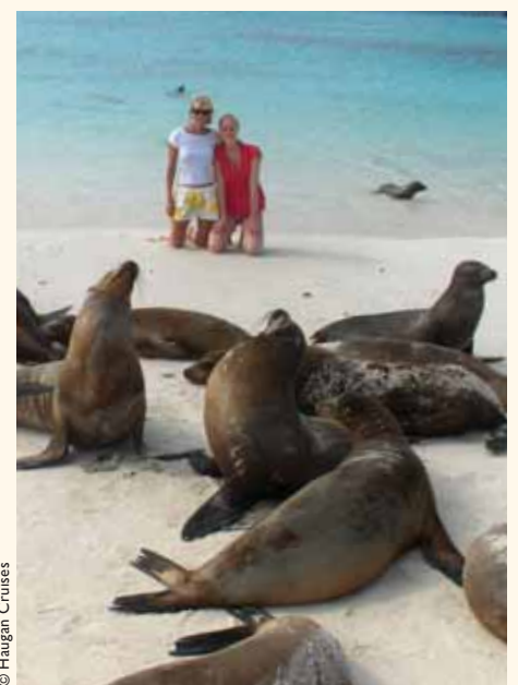
Up-close encounters with the wildlife